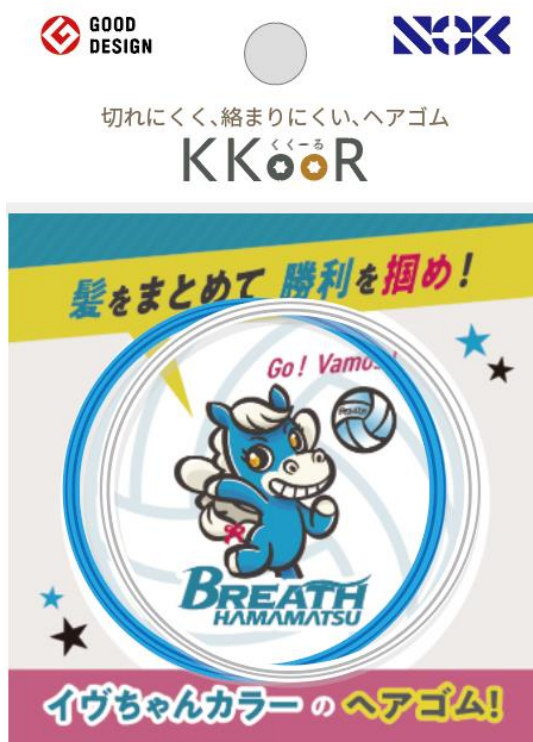
KKOOR × Breath Hamamatsu Package Image